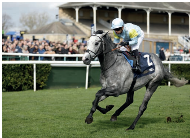
Charyn winning the Al Shaqab Lockinge Stakes