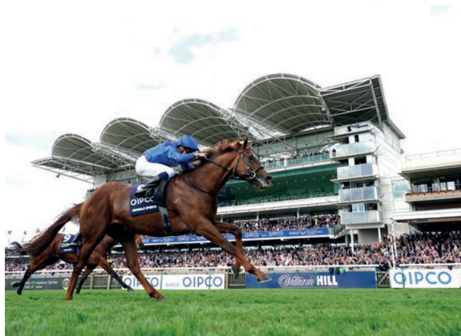
Notable Speech winning the QIPCO 2000 Guineas Stakes