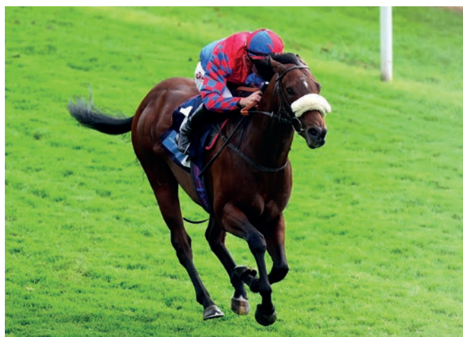
Big Evs winning the British Stallion Studs EBF Westow Stakes