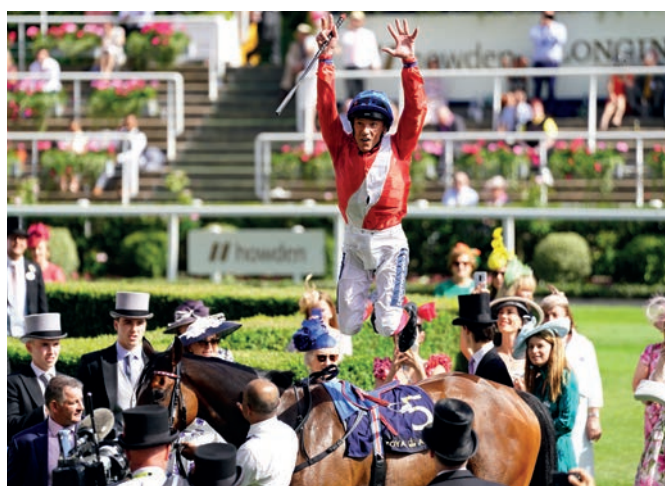
Inspiral wins the Coronation Stakes during day four of Royal Ascot