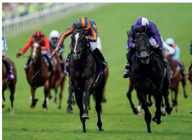
Auguste Rodin (left) wins The Betfred Derby