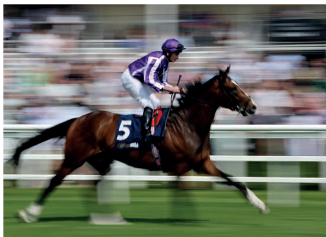
Illinois before the William Hill Lingfield Derby Trial Stakes