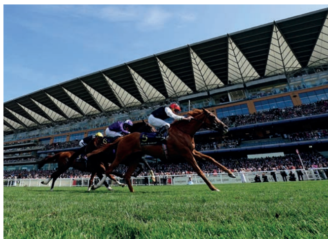
Kyprios wins the Gold Cup during day three of Royal Ascot