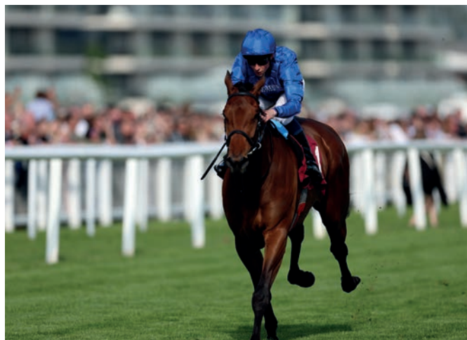
Diamond Rain wins the Haras De Bouquetot Fillies' Trial Stakes