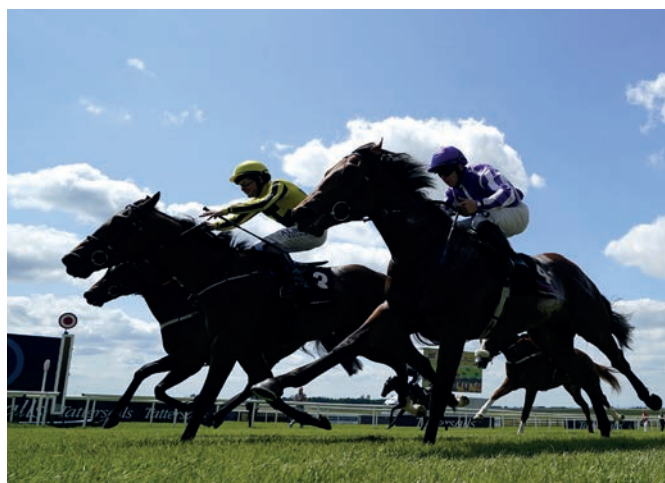
Givemethebeatboys wins The GAIN Marble Hill Stakes