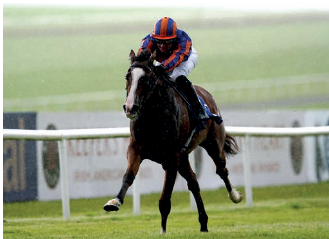
Opera Singer wins the Newtownanner Stud Irish EBF Stakes