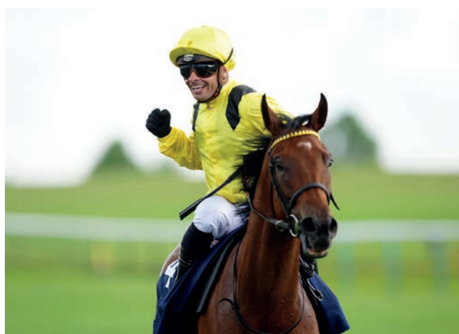
Elmalka wins the The QIPCO Guineas Festival